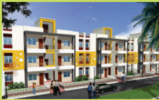
Existing Spring Valley Colony

Spring Valley DEW NEAR AIIMS, KATARA HILLS Hoshangabad Road, Bhopal