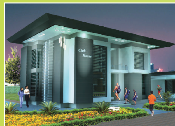
• Club House